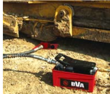
Air pumps can be used in a variety of industrial settings