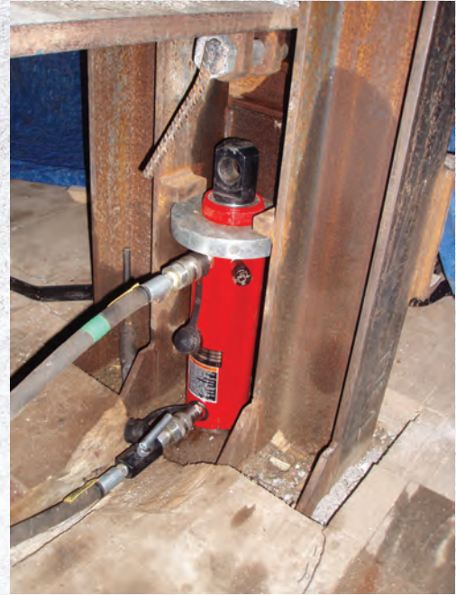
HD cylinders can be used in pushing and pulling applications