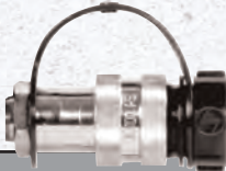
High-Flow Coupler:CH38F Included on all models